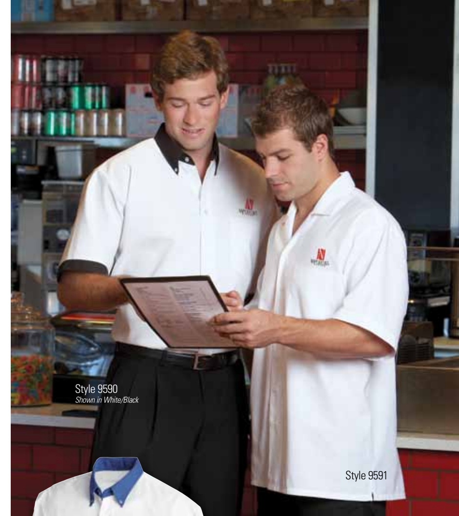
Style 9590 Shown in White/Black