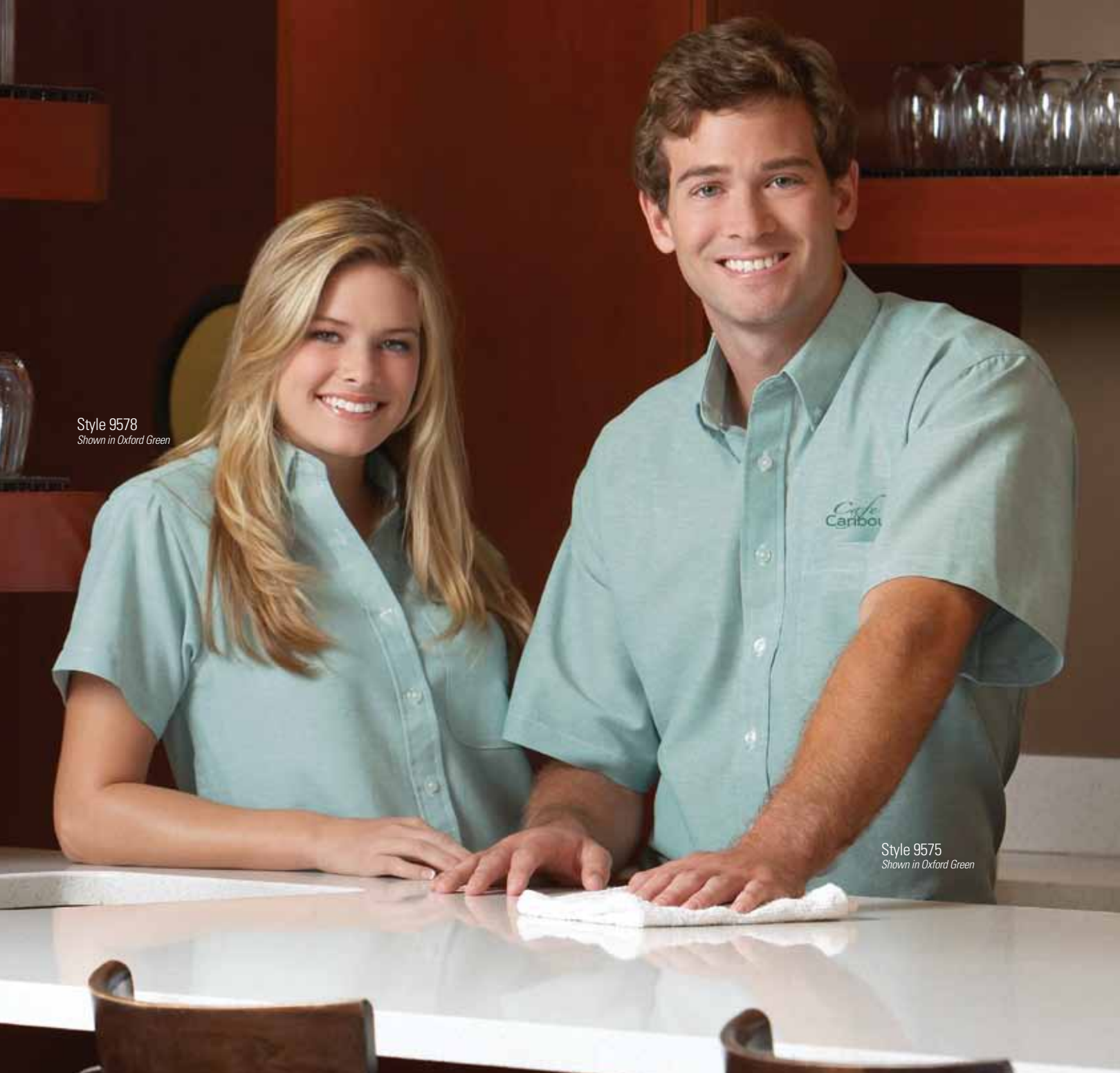
Style 9578 Shown in Oxford Green